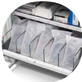
XT Pull-Out Shelf