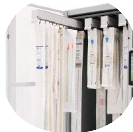
XT Supply Rack