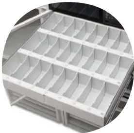
XT Supply Drawer