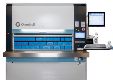
Omniceil® Pharmacy Carousel