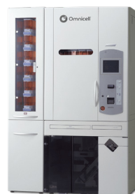
Omniceil® Medication Packager