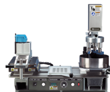
Omniceil® Central Pharmacy Blister Packager

Visit Omnicell.com/CPM to learn more today.