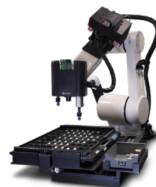
Omniceil® XR2 Automated Dispensing System