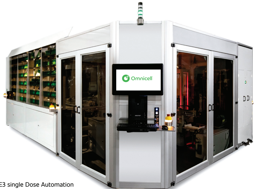
E3 single Dose Automation