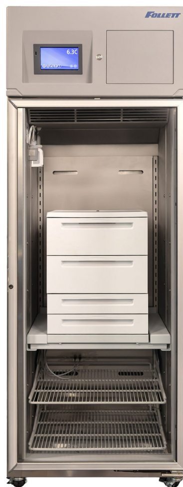
MedChill integrated with Follett refrigerator

MedChill is also available in multiple drawer and bin configurations to meet your medication dispensing needs.