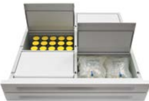
6-Bin Double-Deep Drawer