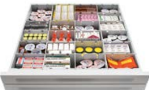
24-Bin Double-Deep Drawer